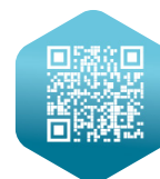
Digital Product Passport