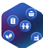
Supply Chain Due Diligence Act